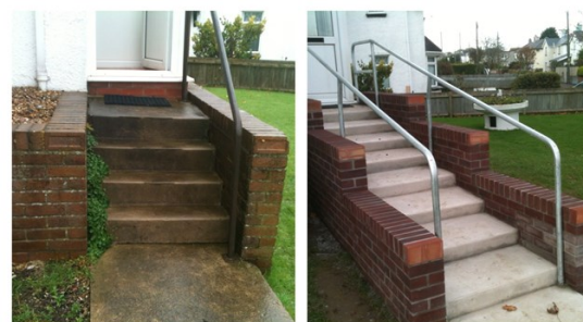
Example of property improvement by Care and Repair via Accommodation Solutions.

Client Feedback to the Accommodation Solutions Team