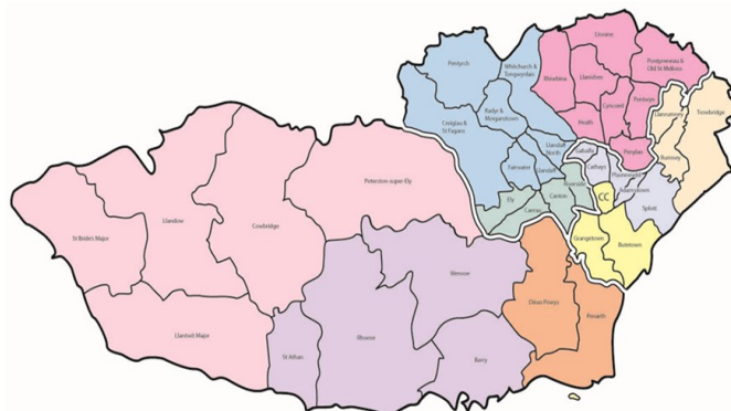
Cardiff and Vale of Glamorgan Locality and Neighbourhood Structure

Within Cardiff and Vale of Glamorgan we have three Localities: Cardiff North and West , Cardiff South and East , and the Vale of Glamorgan . Each Locality has three Primary Care/GP clusters. Local authorities and partners work within Neighbourhoods which are geographically the same as clusters.